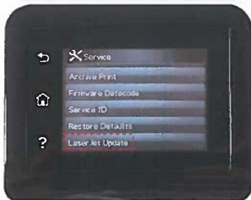
a) Click "LaserJet Update"