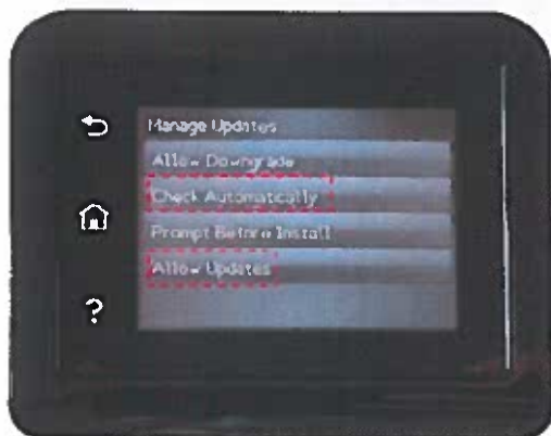
c) Choose "Check Automatically" and "Allow"