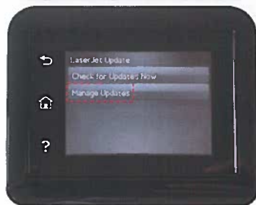
b) Choose "Manage Updates"